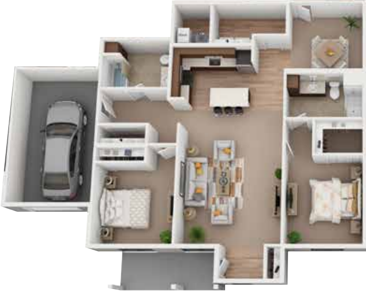
Casetta A/D - approx. 1,650 sq. ft.