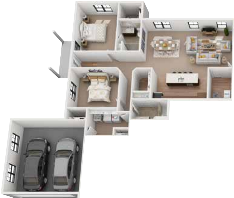
Casetta B/C - approx. 1,800 sq. ft.